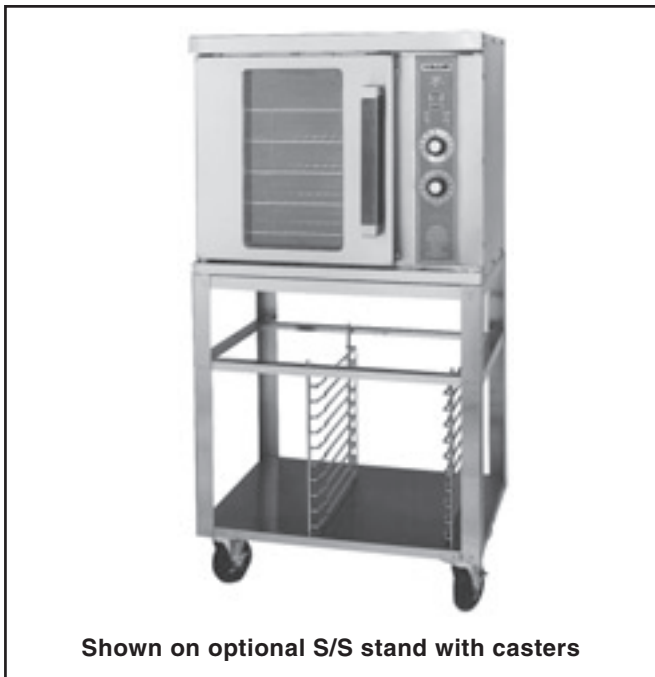
Shown on optional S/S stand with casters